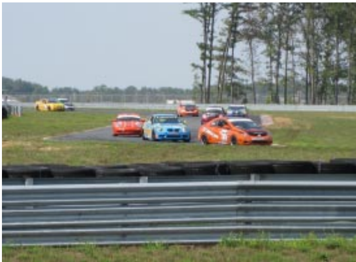
Continental Tire Challenge Race Field