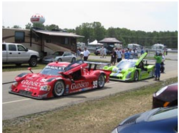
Rolex Grand Am Daytona Prototypes