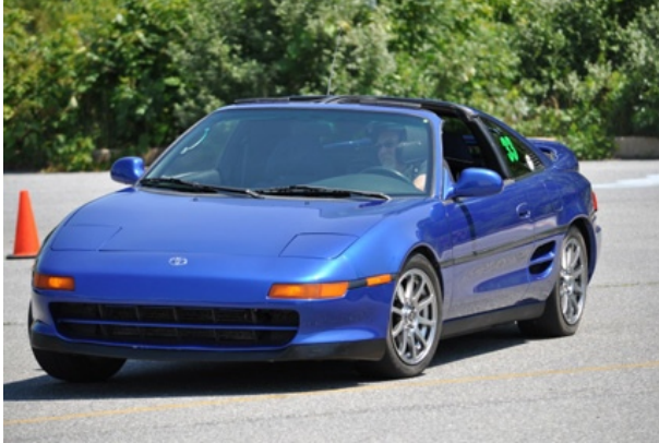
Phil Worrell - ES Toyota MR2