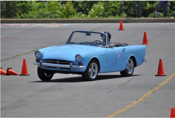
Gregory Bell - HS Sunbeam Alpine