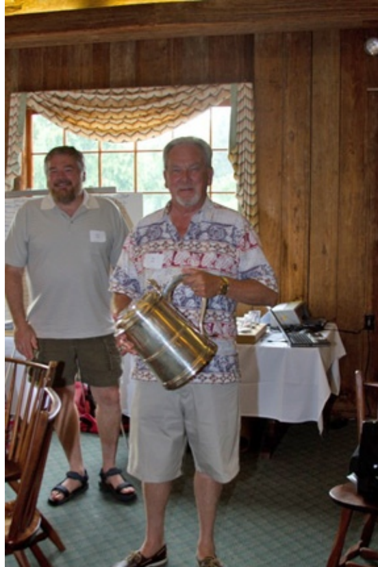
Picnic