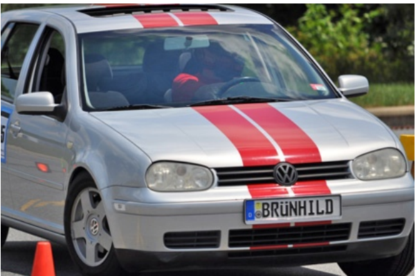
Grant Banning - HS VW Golf