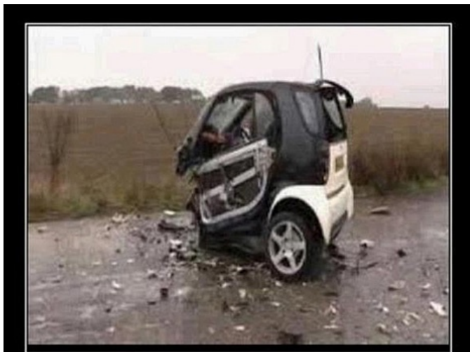
I hit a deer Deer laughed and walked away

Note: The email box for pre-registering entries for the Greenville Show is now open. greenvilleshowforkids@gmail.com